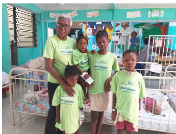
GCH Staff supporting our riders from Haiti!