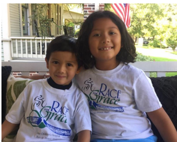
All Smiles On Race Day!

Donations are still being accepted to support this event. For more information visit HERE .