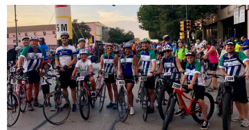
Ready to Race for Grace!