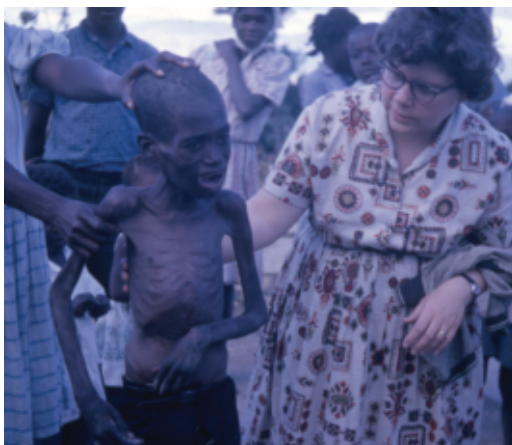
Virginia vowed never to turn a child in need away, no matter how dire the case.