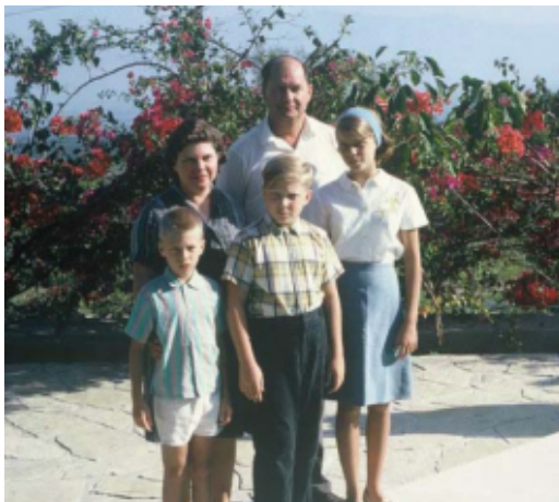
The Snavley family dedicated nearly 7 years to beginning Grace Children’s Hospital.