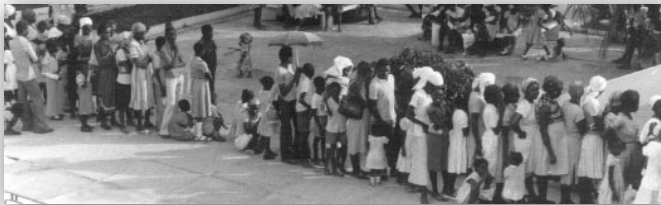
Grace Children's Hospital – 35th Anniversary

"Grace Children's Hospital has expanded in their desire to meet the challenge of controlling tuberculosis...It was evident that we were not adequately screening families of the patients that we admitted to the hospital... We opened our outpatient department to cover this need as well as increase the services available to the public." (Grace Notes 1978)