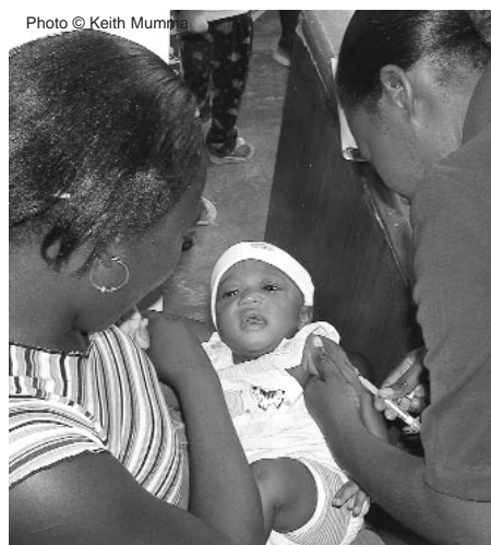
This infant is receiving vaccinations against diphtheria, tetanus, whooping cough and measles at an ICC mobile clinic in Cité Okay, a shantytown near Grace Children's Hospital.

Through International Child Care suffering children and their families are receiving health and hope. It costs $9.00 (US) per day to provide medical care to a child at Grace Children's Hospital.