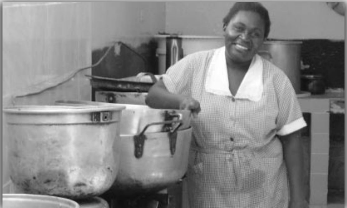
A Grace Children's Hospital cook enjoying the new kitchen facilities.

A second project with CFTC is already in the planning for the 1st quarter of 2004 for $100,000 to improve the quality of life and nutritional status of people living in ICC's intervention area in the Northern department (Grand Riviere and Bahun). By developing a partnership with Canadian Feed the Children, ICC is endeavoring to reinforce its capacity to meet the needs of people in these northern communities.