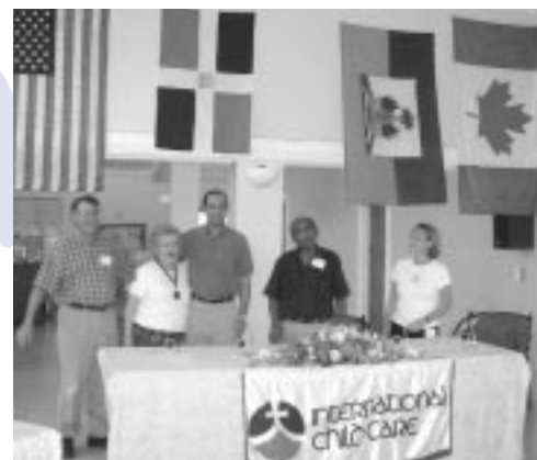
Partnership is strengthened as Cuidado Infantil Dominicano is officially recognized with the signing of the amended Joint Ministry Agreement of International Child Care.

If you would like ICC's 2003 Financial Statement, please log on to our website at www.intlchildcare.org under Financial Accountability or call your national office.