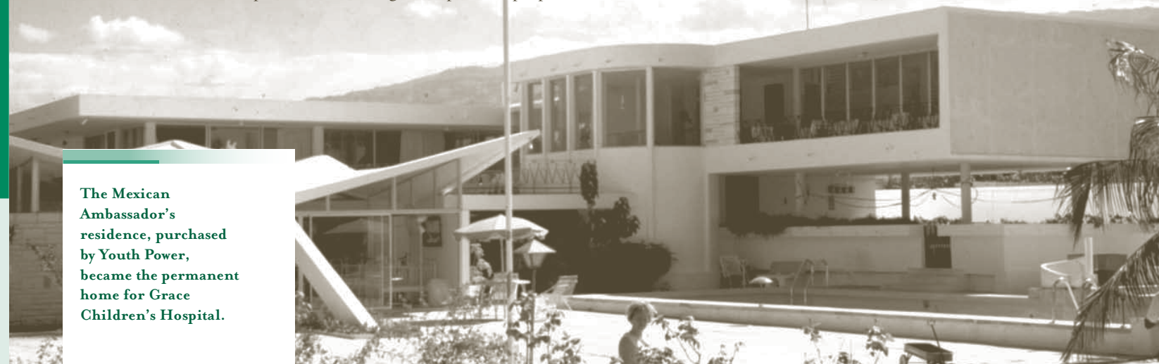
The Mexican Ambassador's residence, purchased by Youth Power, became the permanent home for Grace Children's Hospital.